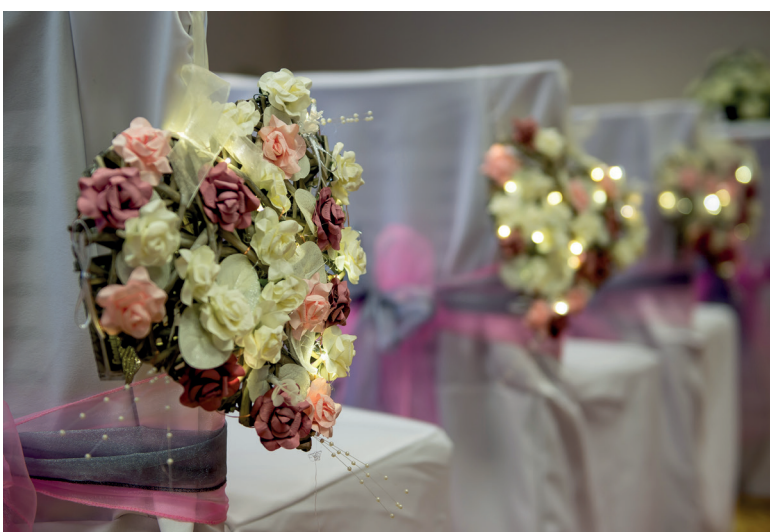
Top; photography courtesy of David Webb North East Wedding Photographer

Bottom; photography courtesy of S Howard Photography Ltd